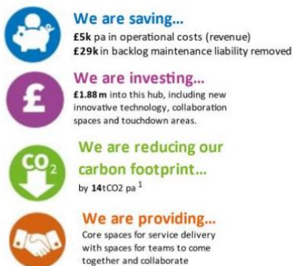
Schedule of Accommodation

Partial refurbishment of Saltash Leisure Centre to support viability of leisure centre operations and create an Integrated Services Hub. On hold pending agreement with leisure centre operator (GLL) re their intentions and maintenance programme.